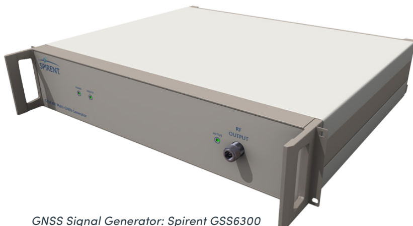
GNSS Signal Generator: Spirent GSS6300

The GSS6300 GPS/SBAS performance is equivalent to Spirent's proven GSS6100 Single Channel Production Test System. In addition, the GSS6300 offers QZSS, GLONASS, BeiDou and Galileo test capabilities to support your evolving GNSS testing needs.